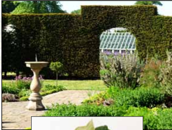
Glenarm Walled Garden

The walled kitchen garden was built in the late 1820s, roughly at the same time as work began remodelling the house into a neo-Jacobean mansion, a short distance to the east. The adjacent frame yard was added in the 1840s, while the well maintained lean-to glasshouse is mid-19th century and later in date. The garden retains its original grid layout, complete with a yew circle planted in the 1850s. Over the past fifteen years the present Viscount Dunluce has undertaken a major programme of developing and expanding the plantings and opened the garden to the public in 2005.