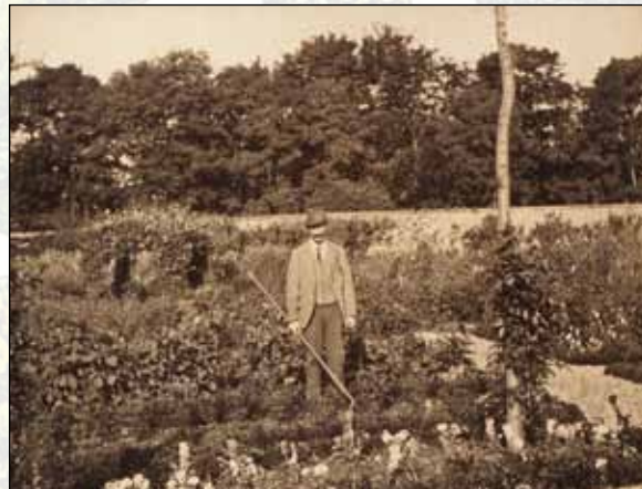
Benvardeen walled garden c.1900

This walled garden of about 1½-acres was already in existence when Benvardeen was acquired by the Montgomery family in the 1790s. Described as 'well stocked and very productive' in 1832, it preserves its original layout and remains a kitchen garden. Its neat rows of fruit and vegetables, espalier fruit trees, paths bordered with box and greenhouses, combined with shrub borders, roses and parterres, this garden, uniquely in Ulster, retains its Victorian character