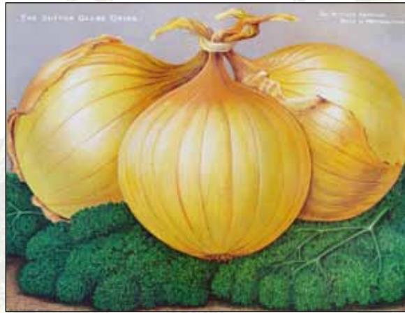
Globe onions (Suttons)