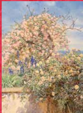
Roses at Telemly, Algiers