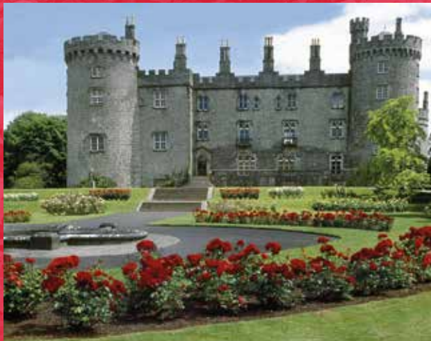
North front of Kilkenny Castle and its rose garden

Substantially remodelled in the 17th & 19th centuries, the castle was the principal seat of the powerful Butler dynasty, one time Dukes and Marquesses of Ormonde, who remained here until 1935. Acquired in poor condition by the State in 1967, it has been the subject of a series of major restoration programmes by the Office of Public Works, including the 13th century Parade Tower, the venue of our 2019 conference - remodelled internally with one of the best lecture theatres in the country. Kilkenny is a wonderfully atmospheric & compact medieval town where all our conference venues are a few minutes walk from the castle; this includes the Pembroke Hotel where many of our speakers will be staying.