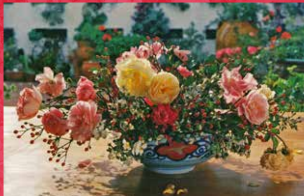
Four late 18th-century 'stud China' roses in early Chinese bowl

Cultivated for its perfume and healing properties, it has achieved status in religion, politics, decoration and literature, most notably as a universal emblem of purity, faith, romance, wisdom, perfection and sorrow. As it retains a central role in our gardens today, we have devised this conference to exploring the transformation of the rose into the full-pedalled beauty of today and to examining its evolving role in our garden designs, art and floristry.