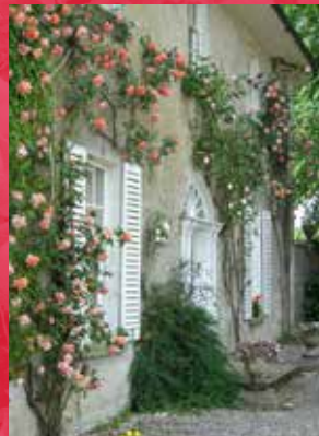
Hardymount front with roses