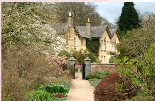
Border, Rowallane, Co. Down