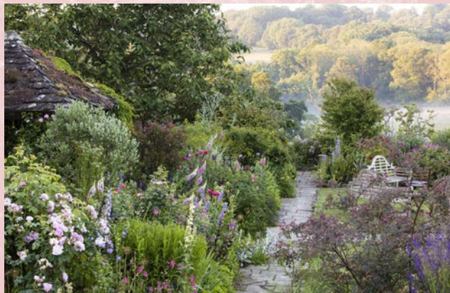
Border, Gravetye, Sussex